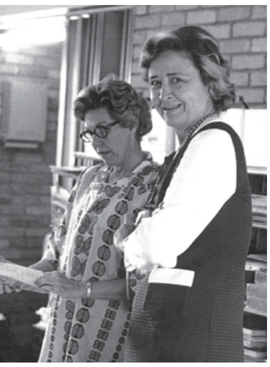
"Try to find an ember of God in every person you meet, and then fan it into a flame and get out of the way!"